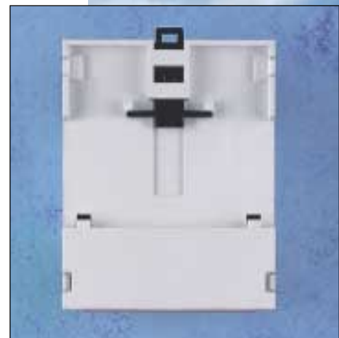
DIN rail mounting